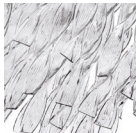
CS "Rigadin" crystal